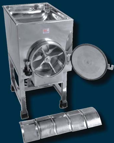
Single Rotor Wet Pulverizer for TW-WP-1202

Note:- Model No TW-WP-1204, TW-WP-1205, TW-WP-1206 are available only in three phase.