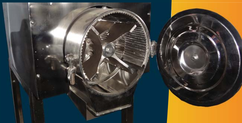
Double Rotor Wet Pulverizer for TW-WP-1203