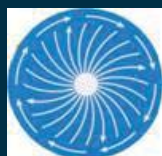
30° Lead average material will being to spiral