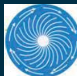
60° Lead average material will give maximum screening pattern