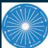
0° Lead average material will be through straight

{Example of screen patterns for average materials}